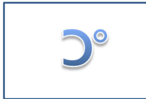
Fig.9-2 Horizontal Flipped Image