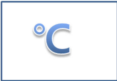
Fig.9-1 Standard Image