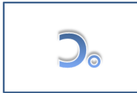
Fig.9-4 Horizontal and Vertical Flipped Image