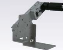
Large paper holder HL2 (φ 200mm)