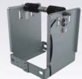
Large paper holder HL3 (φ 200mm)